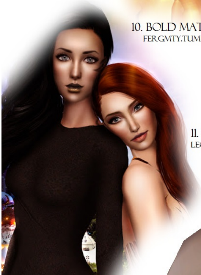
11. METALIC LIPS LECHATNOIR