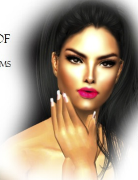
10. BOLD MAT LIPS FER.GMTY.TUMBLR