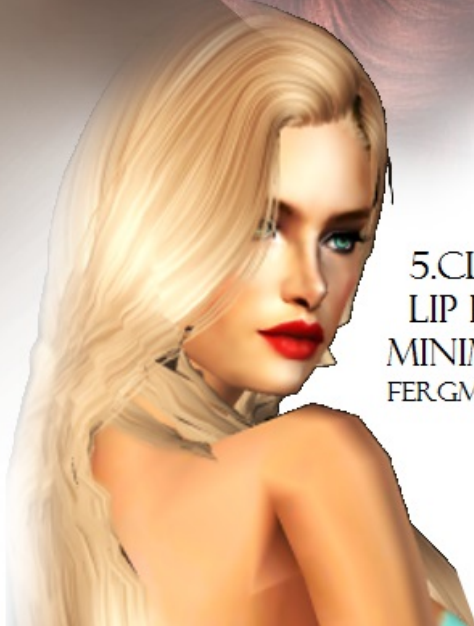
5. CLEAN-CUT RED LIP PAIRED WITH MINIMAL MAKEUP FERGMTY.TUMBLR