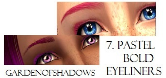
7. PASTEL BOLD EYELINERS