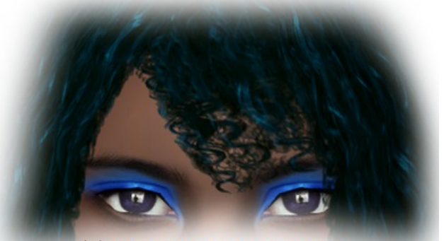
9. THE BOLD BLUE EYES GARDENOFSHADOWS