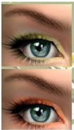
8. SHADES OF ORANGE ANNAMARIASIMS