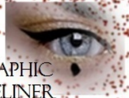
2. GRAPHIC EYELINER GARDENOFSHADOWS