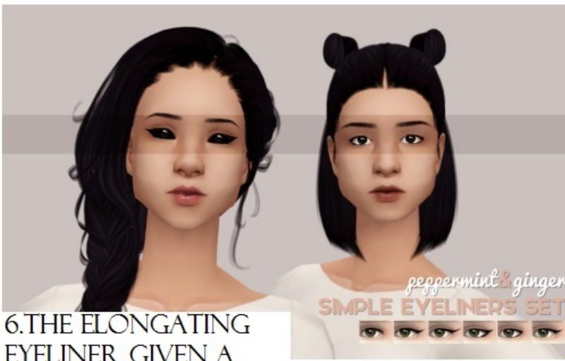
6. THE ELONGATING EYELINER GIVEN A KITTEN-LIKE EFFECT.