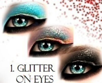
1. GLITTER ON EYES BAILELIZABETH@MTS