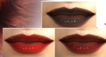
4. GOTH LIPS NABILA-ICI